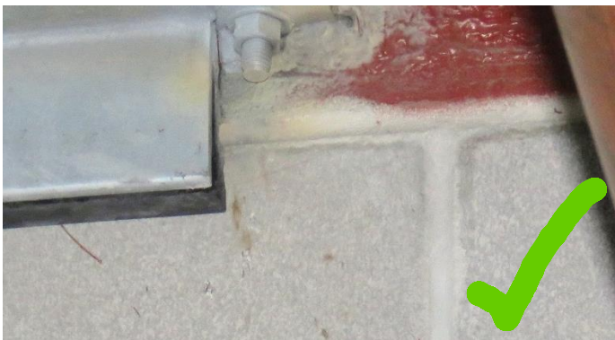
Correct Installation – Firestopping first

Make sure that the firestop installer knows that clips are being installed, so they could properly install the firestopping so it will not encroach into the clip.